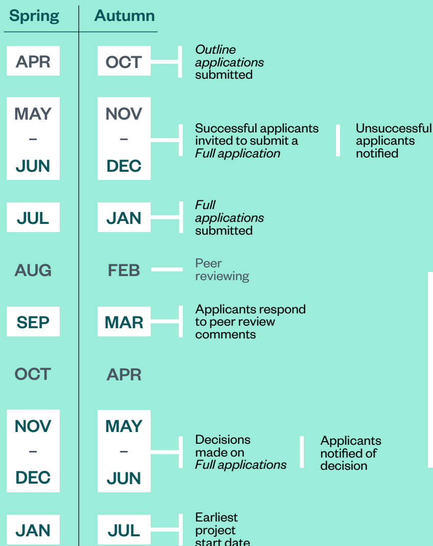
Figure 2: Application timeline

The months on the left-hand side provide an indication of our two grants rounds, but applicants should check the application timeline on our website for key dates and deadlines.